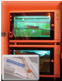
Act II Salon Management

So whether you're here a few minutes or a few hours, we want your experience here to be a wonderful one. We look forward to finding "a style to suit your personality"!